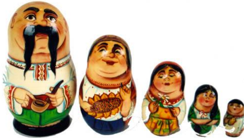
Polyomino, Polyomina, Polyo, Poly, and little Oly.

When, Polyo , wants to rebel from her claustrophobic family, she seeks out solitude to work on very Un-Babushka-like puzzles. That means she wants puzzles where the pieces DO NOT FIT INTO EACH OTHER!!! She feels rather strongly about this.