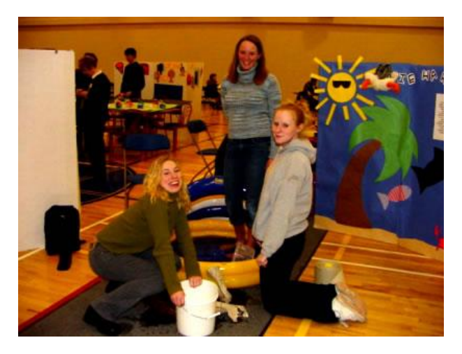
Stepping into the water is not necessary to help Bruce and Samuel.

Luckily, you have been hired as one of those innocent bystanders, but realizing the trouble that Bruce and Samuel are in, you courageously step forward and help.