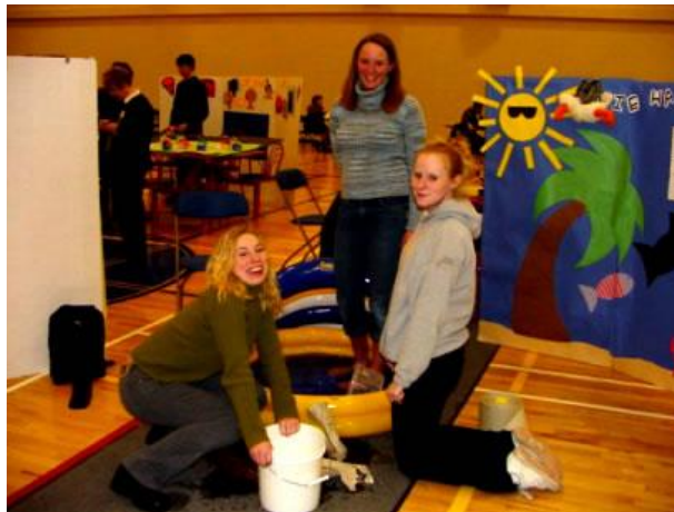
Stepping into the water is not necessary to help Bruce and Samuel.

Luckily, you have been hired as one of those innocent bystanders, but realizing the trouble that Bruce and Samuel are in, you courageously step forward and help.