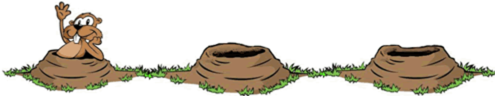
Gordon the Gopher during happier days... posing in the entrance to hole #1.