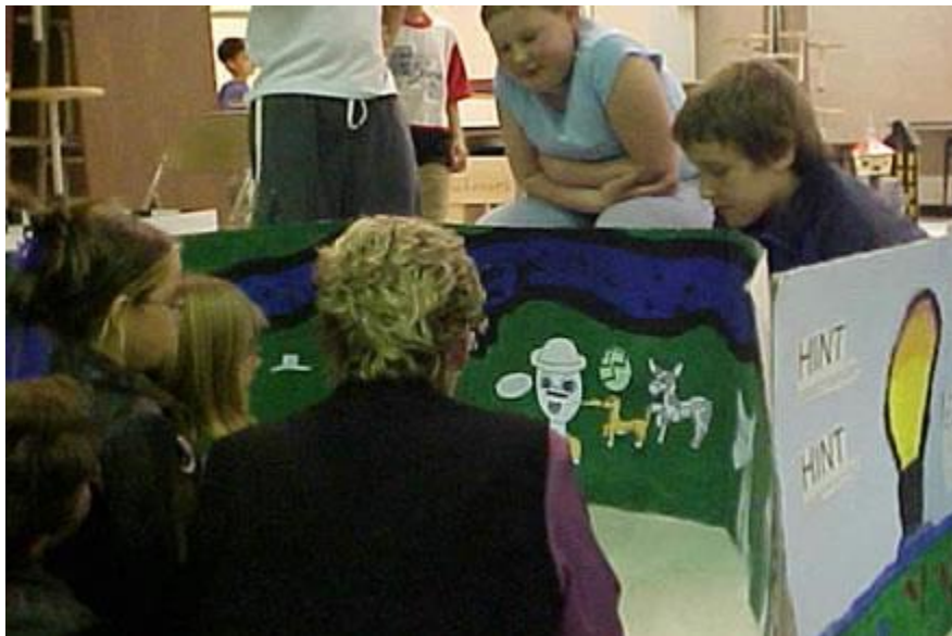
Jedi Knights were replaced by farmyard animals, but the math was the same...