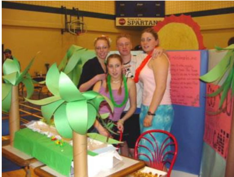
Jedi Knights reworked with a Hawaiian theme...